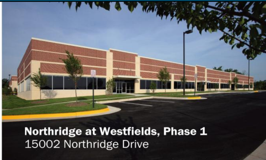
Northridge at Westfields, Phase 1 15002 Northridge Drive