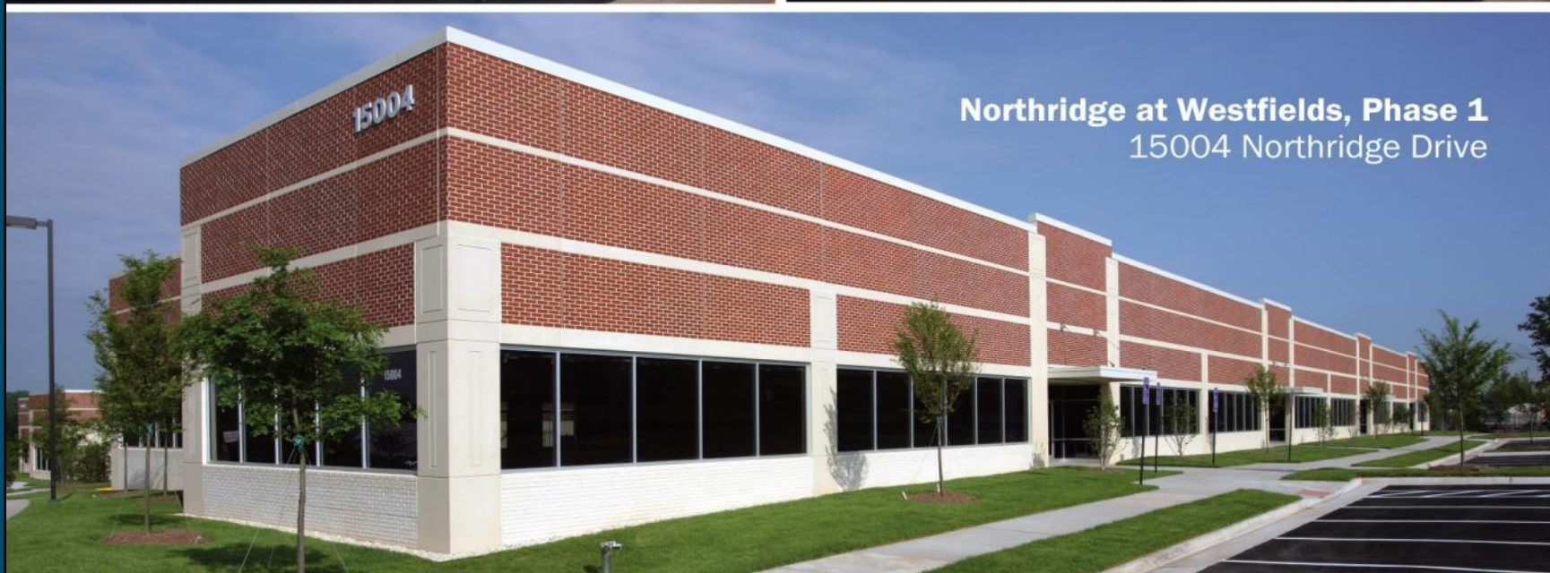
Northridge at Westfields, Phase 1 15004 Northridge Drive