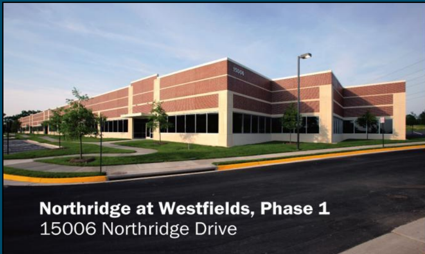
Northridge at Westfields, Phase 1 15006 Northridge Drive