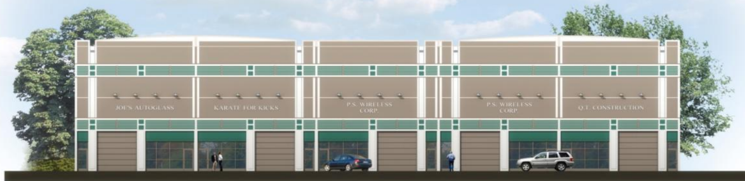
BUILDING 2 FRONT ELEVATION