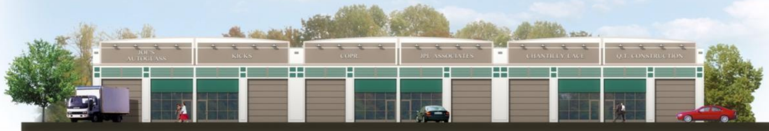
BUILDING 1 FRONT ELEVATION